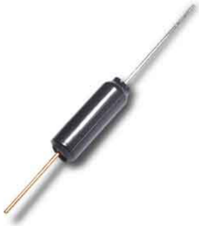
Double Ball Type Tilt Sensing Unidirectional Trigger Switch, When Placed Horizontally, It Can Be Triggered By Shaking