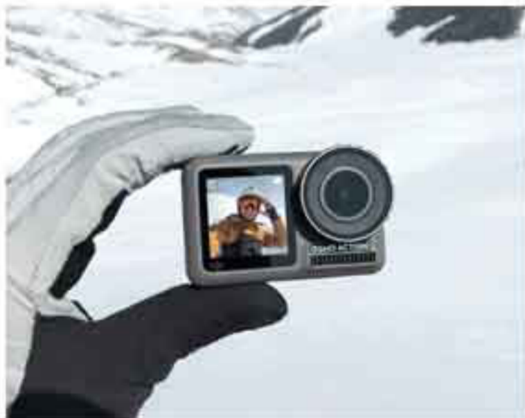
Digital Photo Frame Rotation